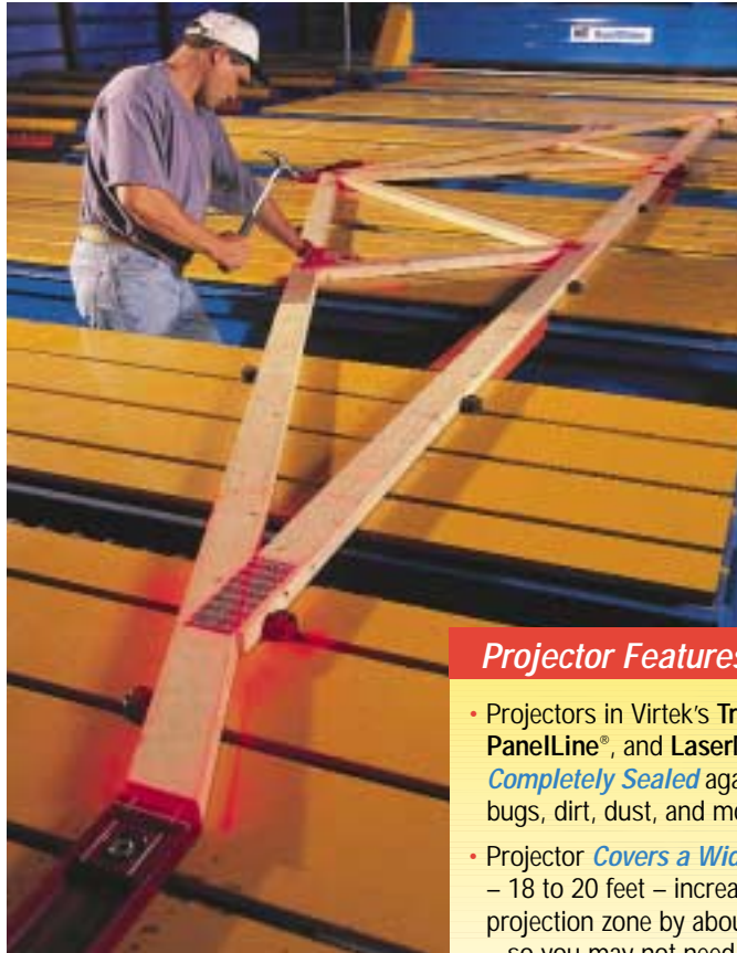
Workers can see the truss and how it fits on the table before beginning so incorrectly cut lumber is instantly identified.

TrussLine reduces setup and changeover times by up to 70%, and increases productivity by up to 25% - with less skilled labor! Flexible production capabilities make it easy to produce multiples or "one-of-a-kind" trusses quickly and easily, increasing manufacturing capacity and efficiency, and lowering per unit costs.