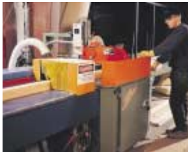
LaserMC saves time and money! Increases productivity – reduces skills needed by labor – interfaces with common panel design packages

Building wall panel components with the fully automated LaserMC® is as simple as feeding data into your computer and selecting the wall panel you want to build.