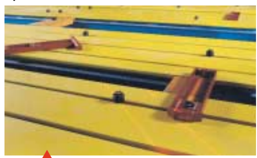
TekSet® Hardware on MiTek slotted-top table

MiTek's versatile TekSet® jigging hardware reduces setup times dramatically, especially when used with MiTek's slotted-top tables. Add Virtek's laser projection systems, and setup delays become obsolete.